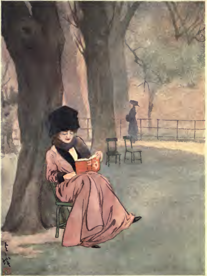
READING IN KENSINGTON GARDENS.